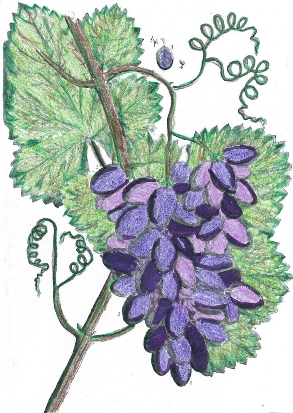
The Vine. { 1. Flower 2. Fruit 3. Fruit open. 4. Stone. } Vitis, Vinifera. Eliz. Blackwell delin. sculp. et Pinx.