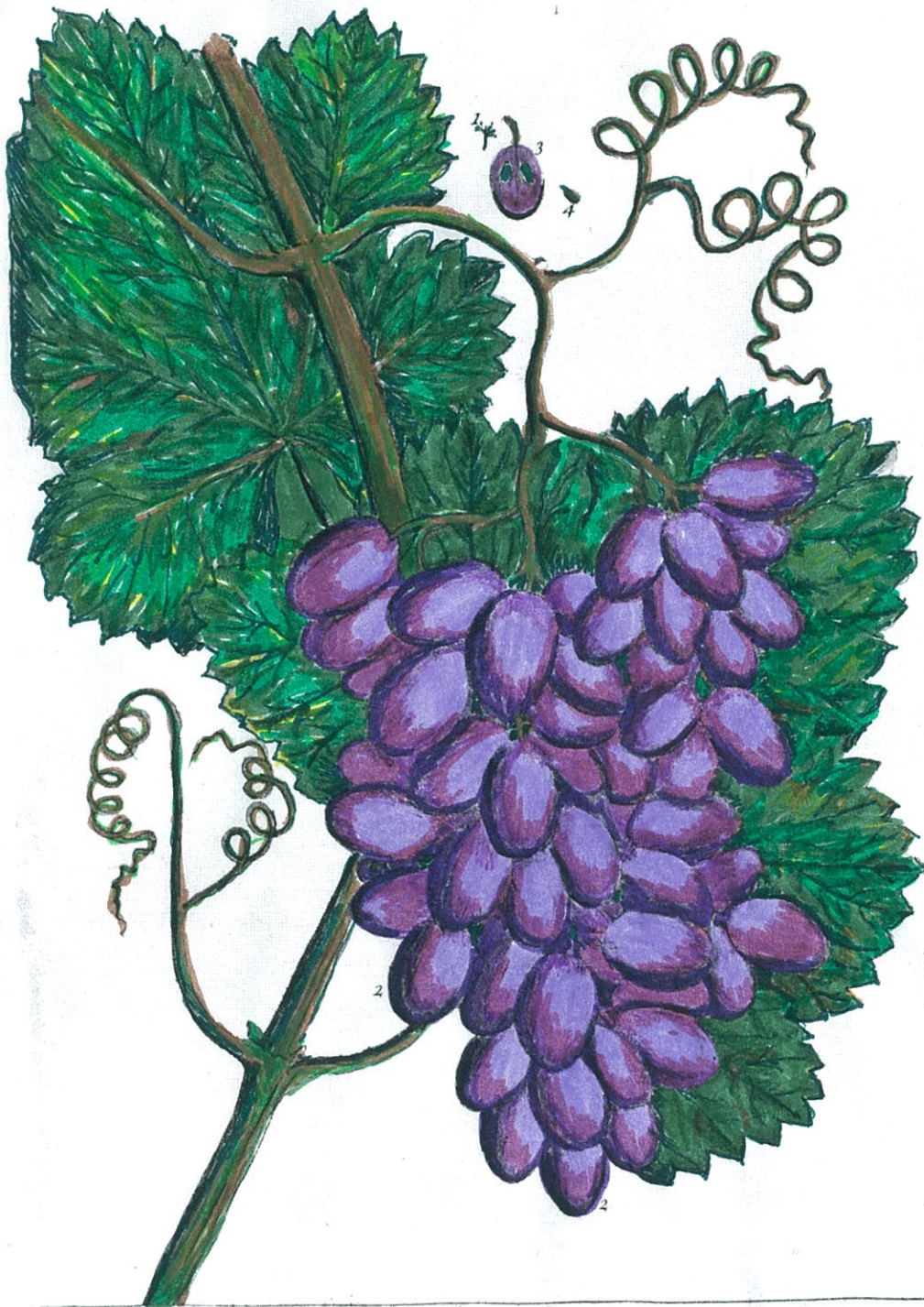
The Vine. Ebz. Blackwell delin. sculp. et Pinx.