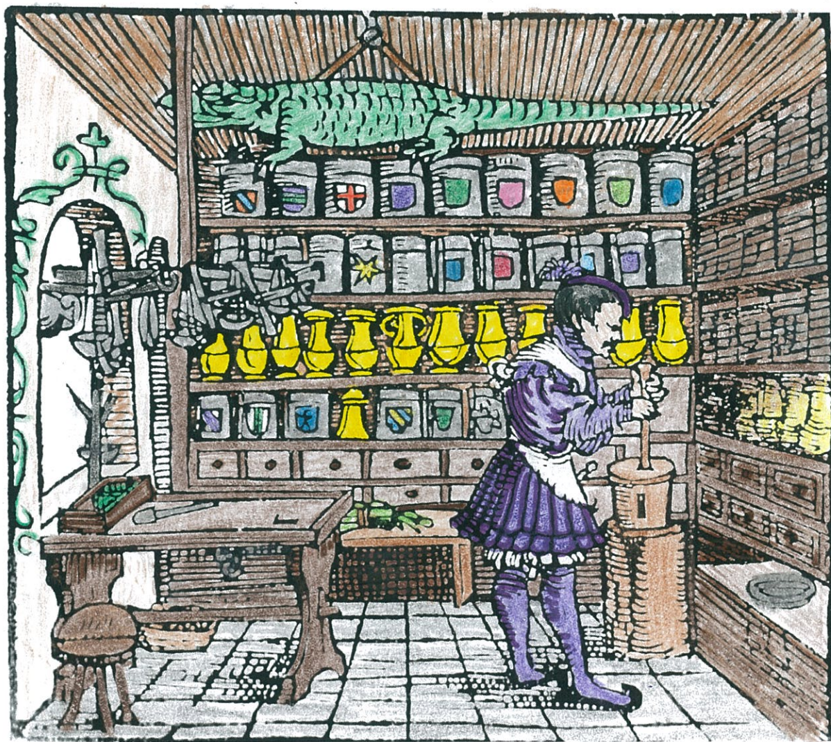
Interior of apothecary shop, 1537